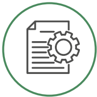
Document Management System

Newgen has successfully passed the certification testing by NRAA's EDRMS Standard and Guidelines, performed by NRAA's National Test Center. Newgen's Electronic Document and Records Management System offerings comprise Newgen's Document Management System, Records Management System, and Correspondence Management System. The EDRMS offerings enable end-to-end record management, facilitating government institutes to remain compliant.