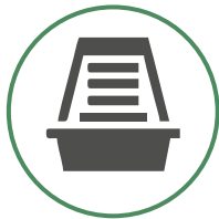
Records Management System