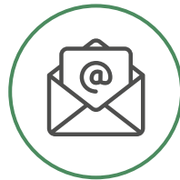
Correspondence Management System

The offerings are certified for capabilities listed below: